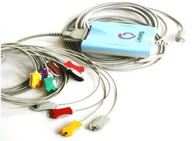
Small pocket size USB-ECG Recorder